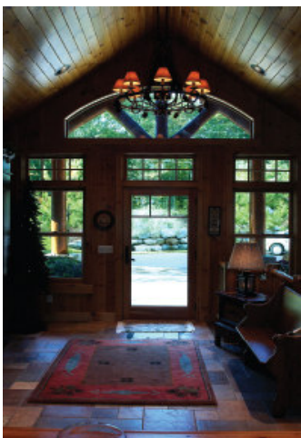
Entry of Erickson Home