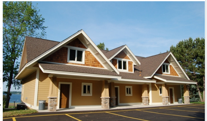
Triplex Unit — exterior and interior ready to be built.

Heidmann Company was instrumental in the conceptualization and design of the new site development, including a water feature with meandering streams, a waterfall and ponds. Drawings for the remodeling of the "Oaks" units, eight new 3-bedroom cottages and a new triplex unit were complete and