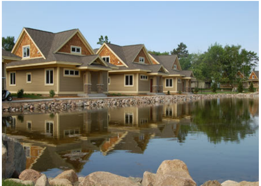
Kavanaugh's three-bedroom units overlooking water feature.

Kavanaugh's Resort started another season of summer fun Memorial Day Weekend, 2006. ☺